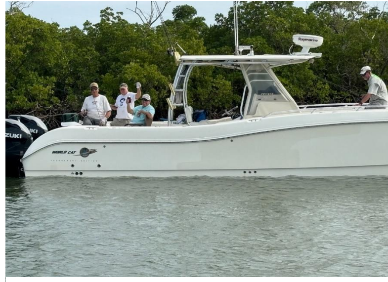
Wacking's 1st Losers--we'll practice and try again