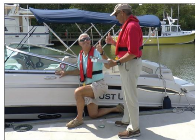
Another successful VSC experience

Download now at: • AmericasBoatingClub.org • Apple Store • Google Play Store