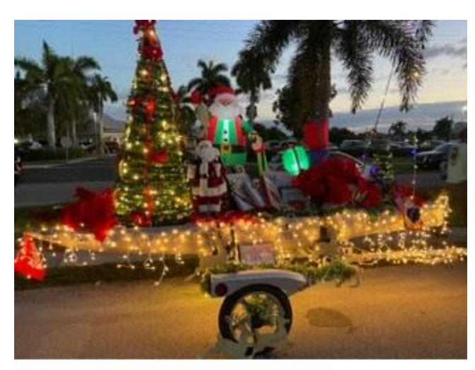
MSC float AKA Santa's Kayak Sleigh