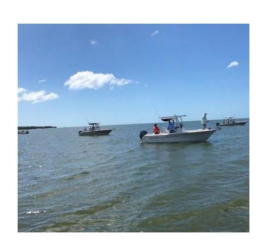
Part of the group with Joe Perino's boat in the foreground