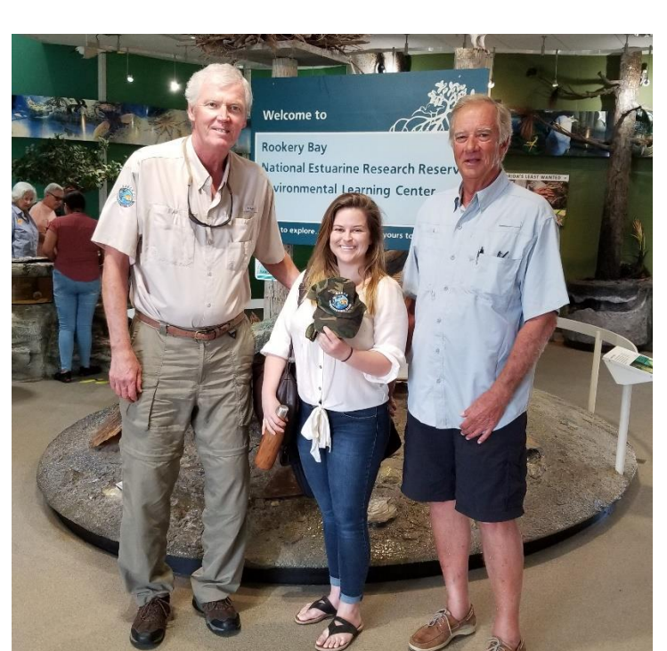
They are tall--she is short