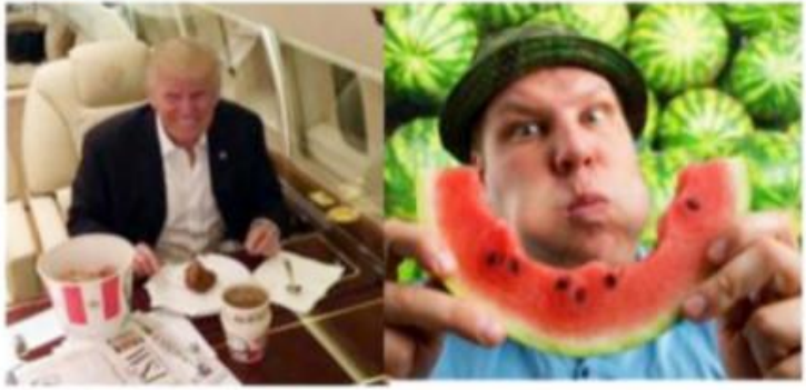
Wed., May 13th 12:00 high-noon----Sarazen Park

Fried Chicken, cole slaw, potato salad, beans,