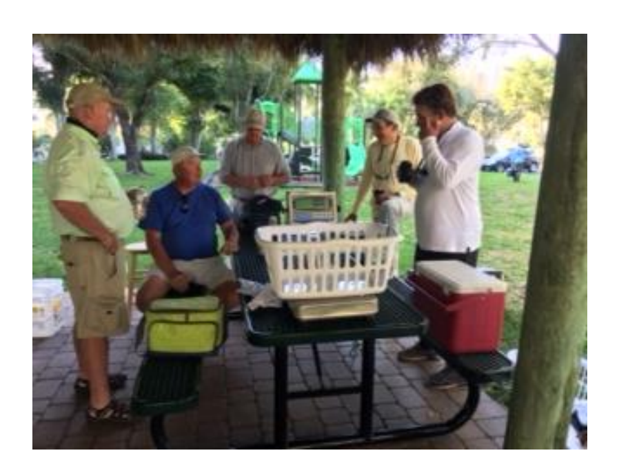
Sheepshead weigh in