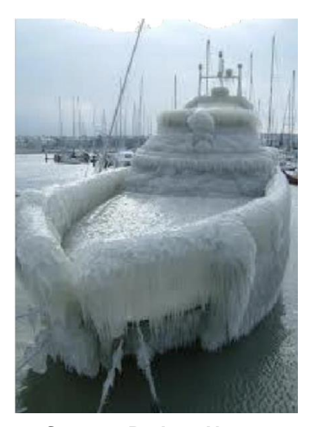
Sarazan Park 12 Noon Wednesday, November 20