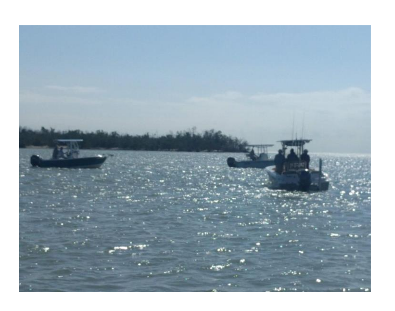
Anglers on the prowl