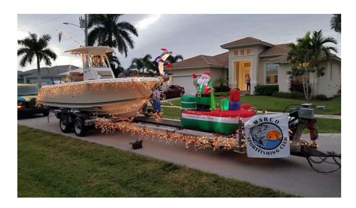
MSC float before the parade start