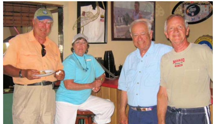
Fish Tales at Crazy Flamingo