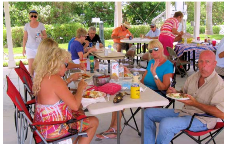
Goodland Park had great picnic area to enjoy a shark steak lunch!