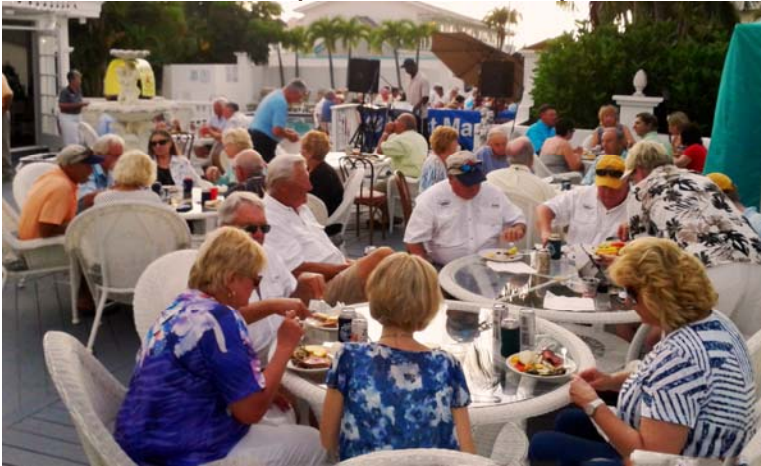
Awards Dinner at Bistro Soleil