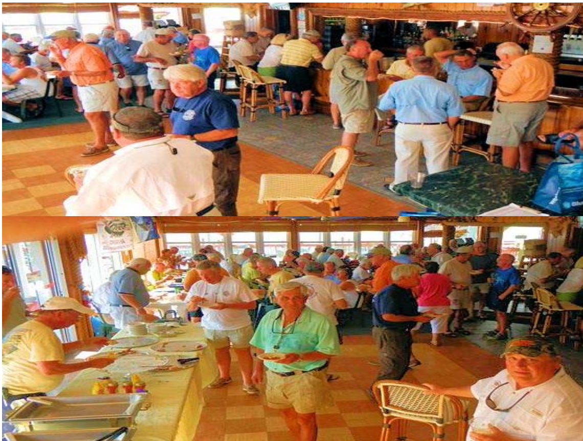
Kickoff at Ole Marco Lodge. Athletes are preparing for Contest.

Congratulations to all who competed in the event, and special thanks to our tournament sponsors, Walker's Marine, Mercury Outboards and Pursuit Boats for helping to make this a first-class tournament!