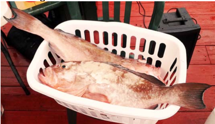
Winning Grouper-50 Mile Division