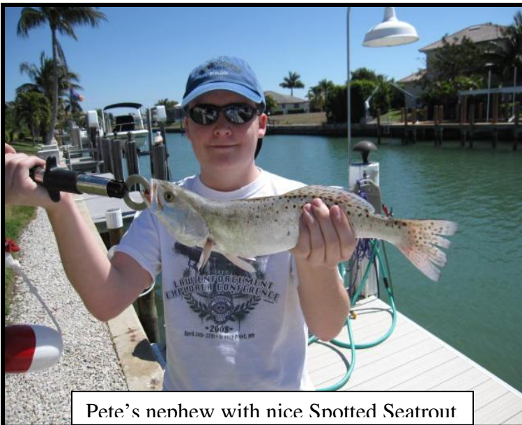
Pete's nephew with nice Spotted Seatrout

Correction!! Naples pier Kids Clinic is April 25. Please contact Myron Wittlin if you can help