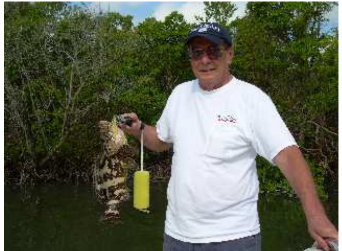
Jack's black had to go back.