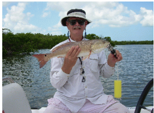
Bill's red was 25" and over 7 pounds.