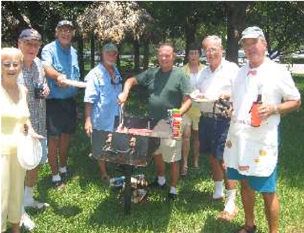
FISH MAY BE GOOD BUT STEAK IS BETTER