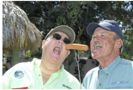
AWARDS PICNIC PICNICKERS